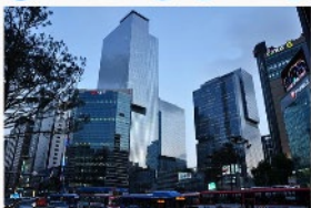
Samsung Town en el área de la estación de Gangnam en Seúl.